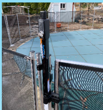
Special spring-lock hardware latches each section to the next. Lock for safety.