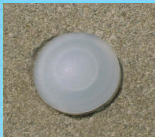
Flush-fit caps secure your anchor sleeves from dirt and debris when your fence is not in use.