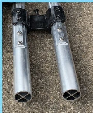
Safe 'n Secure Fencing uses superior strength aluminum quad-core poles.