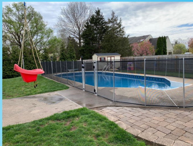
Merlin Safe 'n Secure Fencing is attractive and unobtrusive. Its' design combines practical protection with a clean look. It can be designed to fit any pool.