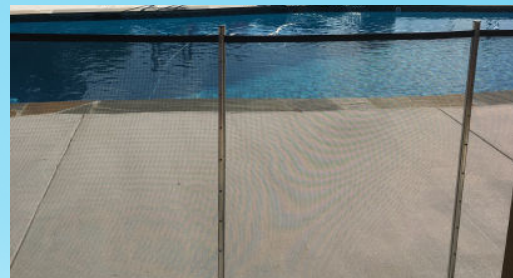
Merlin Safe 'n Secure Fencing features weather-resistant heat-sealed black mesh fabric and sewn top and bottom hems.

Safe 'n Secure Fencing is simply the most versatile and convenient fencing solution available to swimming pool owners who want to add an additional layer of protection around their pools. It's the ultimate in backyard barriers, a removeable fence that blocks unwanted entry without obstructing visibility.