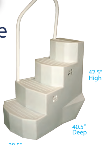
Duke step shown in White Granite